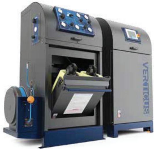
Fill station module showing optional hose reel