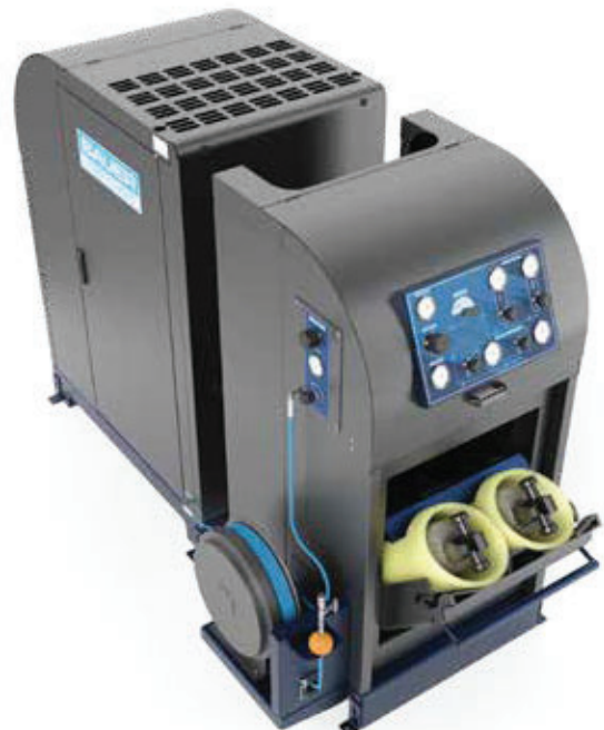
Fill station module showing optional hose reel